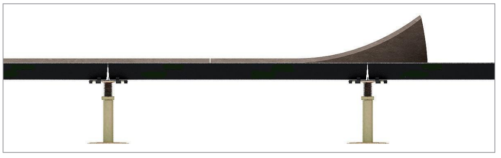
PVC tiles have a different size compared to the raised floor panels. This means that the PVC tiles cover the seams of the raised floor